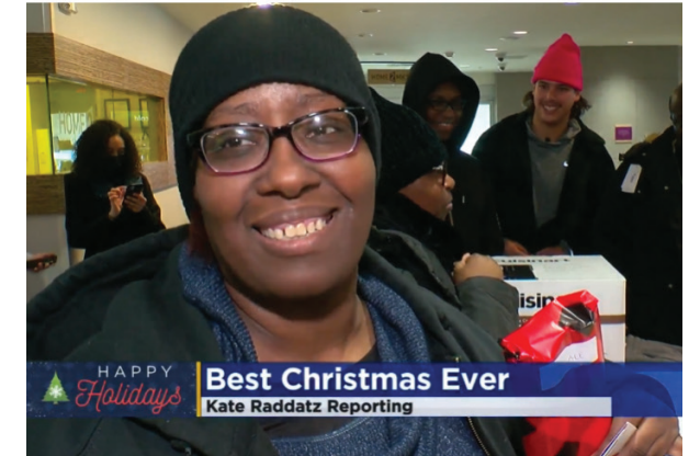
The Story featured on CBS News